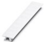
Zack marker strip, can be ordered: Strip, white, labeled according to customer specifications, mounting type: snap into tall marker groove, for terminal block width: 6.2 mm, lettering field size: 6.15 x 10.5 mm, Number of individual labels: 10

Zack marker strip - ZB 6,LGS:FORTL.ZAHLEN - 1051016