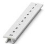
Zack marker strip, Strip, white, labeled, can be labeled with: CMS-P1-PLOTTER, Printed vertically: consecutive numbers 1 ... 10, 11 ... 20, etc. up to 491 ... 500, mounting type: snap into tall marker groove, for terminal block width: 6.2 mm, lettering field size: 6.15 x 10.5 mm, Number of individual labels: 10

Zack marker strip - ZB 6,QR:FORTL.ZAHLEN - 1051029