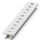
Zack marker strip, Strip, white, labeled, can be labeled with: CMS-P1-PLOTTER, printed horizontally: consecutive numbers 1 ... 10, 11 ... 20, etc. up to 491 ... 500, mounting type: snap into tall marker groove, for terminal block width: 6.2 mm, lettering field size: 6.15 x 10.5 mm, Number of individual labels: 10

Zack marker strip - ZB 6,LGS:FORTL.ZAHLEN - 1051016